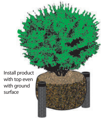
Install product with top even with ground surface